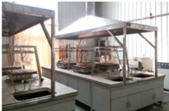
Intercrystalline corrosion test