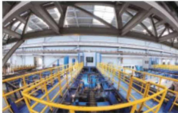
70MPa water pressure testing machine