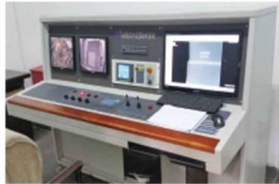
Rt real time imagery detection