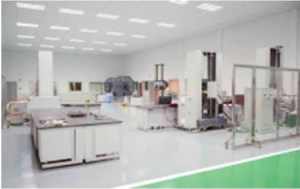
Physical and chemical lab of steel pipe

Complete testing equipment, for the physical and chemical properties of steel pipe testing, technology research and development to provide security