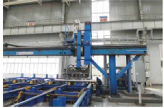
630 ultrasonic testing unit