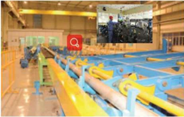
90 ultrasonic testing unit