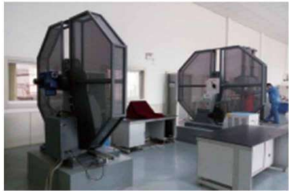
Impact testing machine