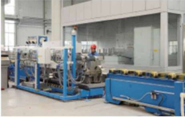
40 vortex - over combined flaw detection unit