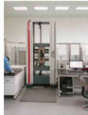
Flaring and flattening machine pipe drawing machine