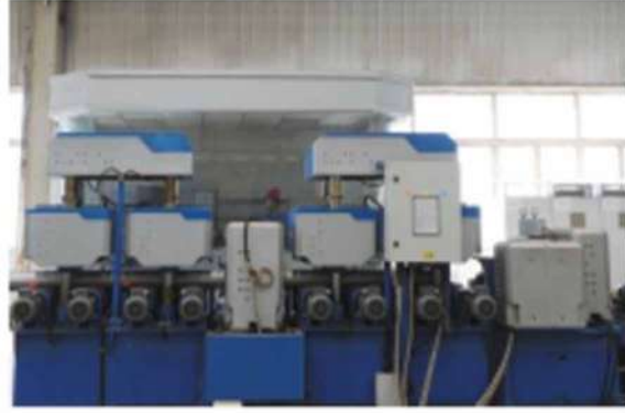
Eddy current inspection unit